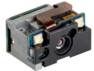
TC8000-1 Standard Range Imager