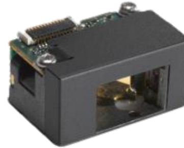
TC8000-A 1D Standard Range Laser