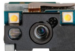
TC8000-2 Medium Range Imager